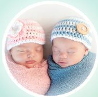
Multiple Pregnancy 多胎妊娠