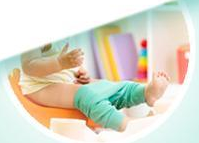
Child Development 小児の発達