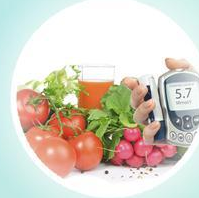
Gestational Diabetes 妊娠糖尿病