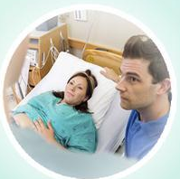
Labour and Delivery 労役と分娩