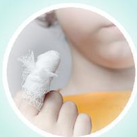
First Aid 応急処置