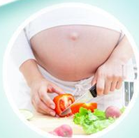
Healthy Lifestyle 健康的な生活習慣