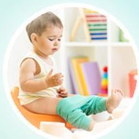
Child Development 小児の発達