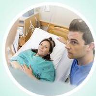
Labour and Delivery 労役と分娩