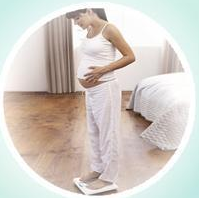
Changing Body 赤ちゃんの成長と変化