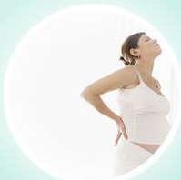
Symptom Search 症状から検索