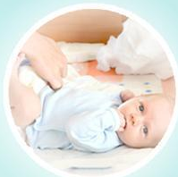
Caring for Your Baby at Home 在宅育児