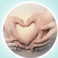
Relationship after Baby 信頼関係