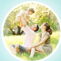
Active Everyday Life 毎日の活発な生活