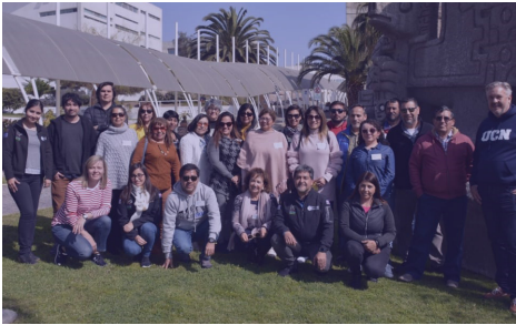
Diploma Programme in Educational Leadership and Innovation with Delta UCN in Chile.