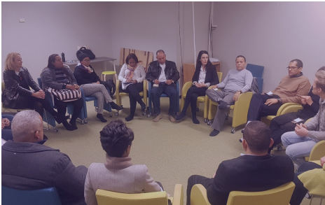
Our guests from the Dominican Republic.