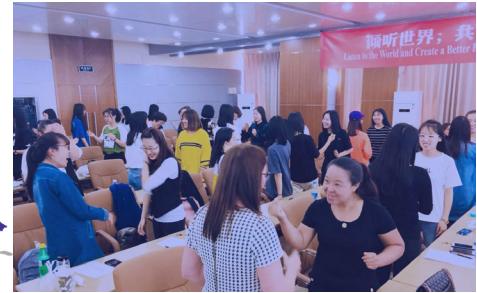
Workshop on Early Childhood Education in China.