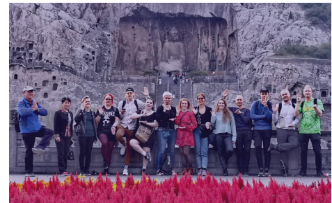
Proakatemia student team in China.