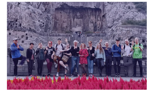
Proakatemia student team in China.