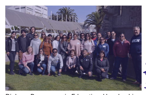
Diploma Programme in Educational Leadership and Innovation with Delta UCN in Chile.