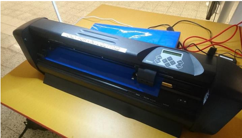
Fig 2: Placement of the material.

After lifting the lever, the cutter will measure the material. If material is not placed correctly it will be folded on the left side. In this case, repeat the loading process. Drive vinyl little bit backwards to reduce wasted material. This is done using arrow keys in control panel. After moving the material, you have to press enter to go back to mode where computer can access the printer.