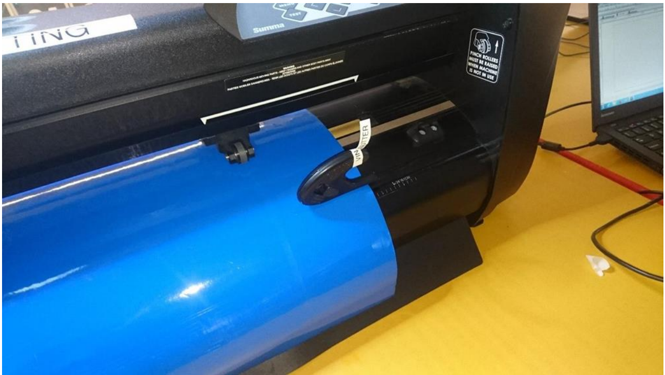
Fig 3: Cutting the paper in the end.