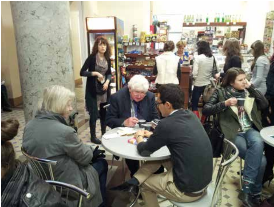
Moscow Readings, November 2013