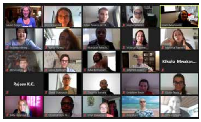
Figure 7: screencapture, online lecture.

The goal for the students was 1) to make sense of the conflict they had chosen, and 2) to consider possible actions that could be taken. In practice, this meant interviewing the "informant" of the case, building understanding of the situation, and applying the lessons learned from the course so far. In the evening session and the following morning, we came together and travelled virtually around the globe to Finland, Indonesia, Mexico, Mozambique, Nigeria, Russia and Tanzania.