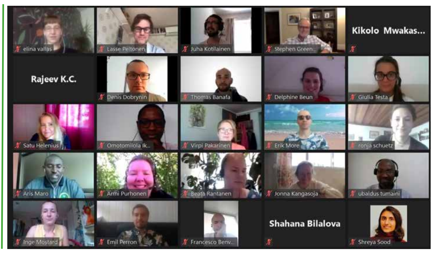
Figure 1: Screencapture, online lecture.