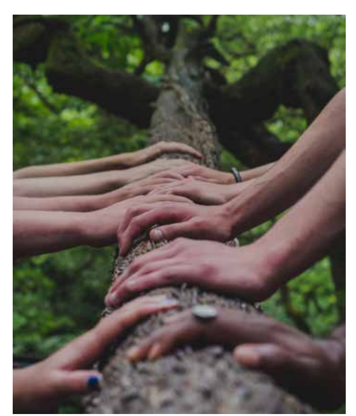
Figure 6: photo by Shane Rounce / Unsplash

Trust can be divided into two dimensions in this context. There is dispositional trust , which is the evaluation of whether you are trustworthy by nature. Then there is situational trust , where it does not necessarily matter if you are trustworthy or not, because the circumstances make it more likely that you will follow through with commitments. Thus, situational trust can be constructed through contingencies if there is little