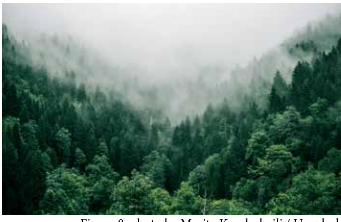
Figure 8:

Despite the promises of collaborative governance, it is clear that one will have to think carefully how to apply this approach in cases where there may be no functioning government or rule of law. However, while working with corrupt governments can be a major barrier, it does not, as Steve contemplated, necessarily have to be a deal breaker. Even a deficient government or its agencies can have a high level of interdependencies or BATNAs, which make them lean towards well framed collaboration. Nonetheless. international exchanges information will be crucial as we try to expand into these new and different contexts. Indeed, publicizing your success stories and using them to raise awareness can be vital lowering the threshold for others to try and follow.